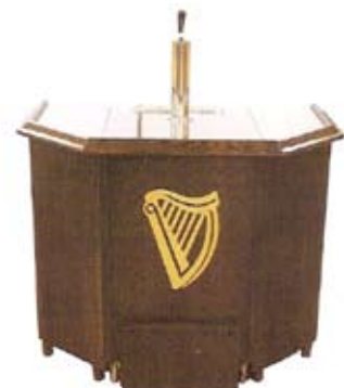
1 Keg Unit

Husker Football Tickets by Nebraska Lottery